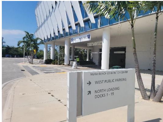
MBCC – Parking – West Entrance