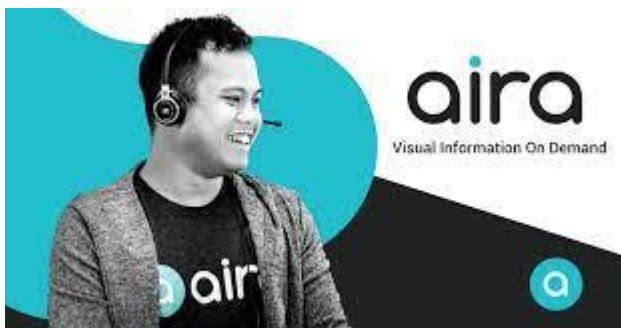
Aira Personal Assistant