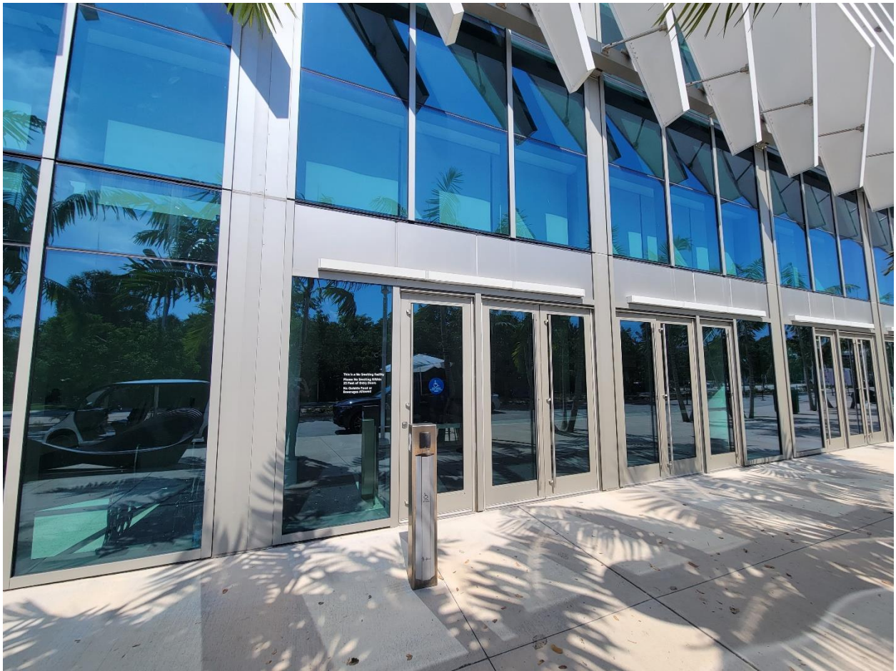
MBCC – ADA Automatic Entrance Doors