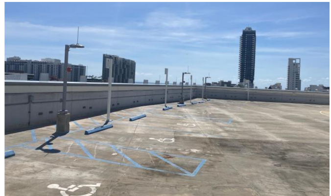
MBCC – Rooftop Parking Northeast 5 th Level