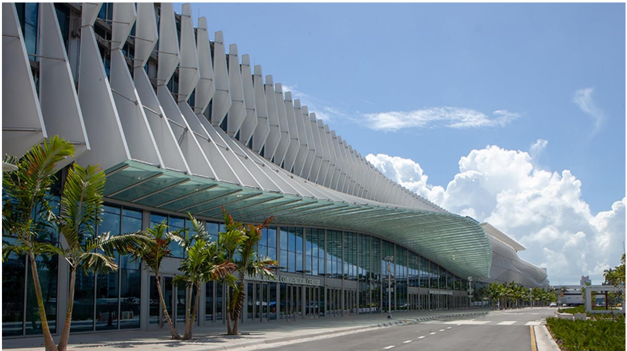
MBCC Main Entrance – Convention Center Drive, Miami Beach, Florida